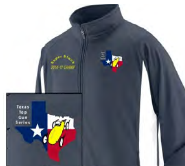
TTGS Champ Jacket & Cash Prize for top TTGS pts earner (Stock & Super Stock)

Cash Prizes: Season Championships 1st - 3rd and TTGS Champs